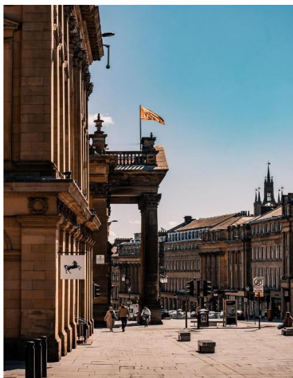
Figure 3 – 19 th Century buildings