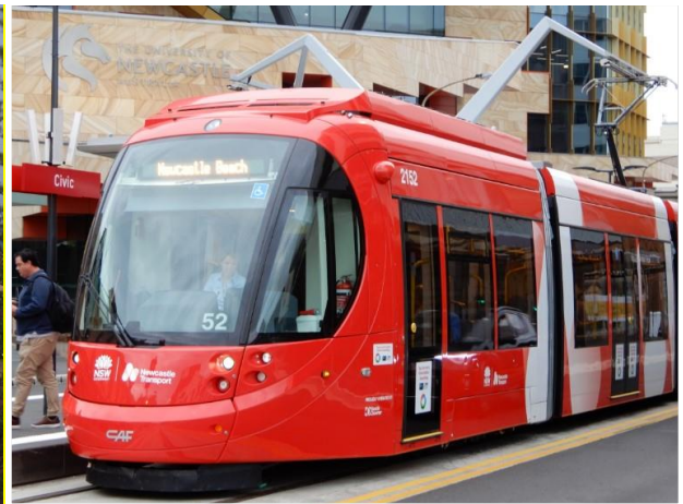
Figure 9 – light-rail system