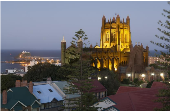
Figure 8 – East End Precinct looking towards Newcastle East

New partnerships have been formed to support this re-designing of the city centre. The university is moving some of its functions to fill the void at Civic, to revitalise the area and support the cultural and youth-based aspects in the precinct. Opening-up the public realm in the East End Precinct is aimed at encouraging more families to return to the centre and to support local services (see Figure 8). Destination NSW is marketing the tourist hub at the Newcastle East Precinct. The catalyst for this re-arrangement of the centre of Newcastle was the long-held desire to remove the railway line that ran along the peninsula separating the core from the waterfront. It has been replaced with a street based light-rail system (see Figure 9) connecting to the wider rail network at a new transport interchange in Wickham beyond the West End Precinct. It is ambitious plan that will add additional precincts to the east and west as part of a polycentric structure.