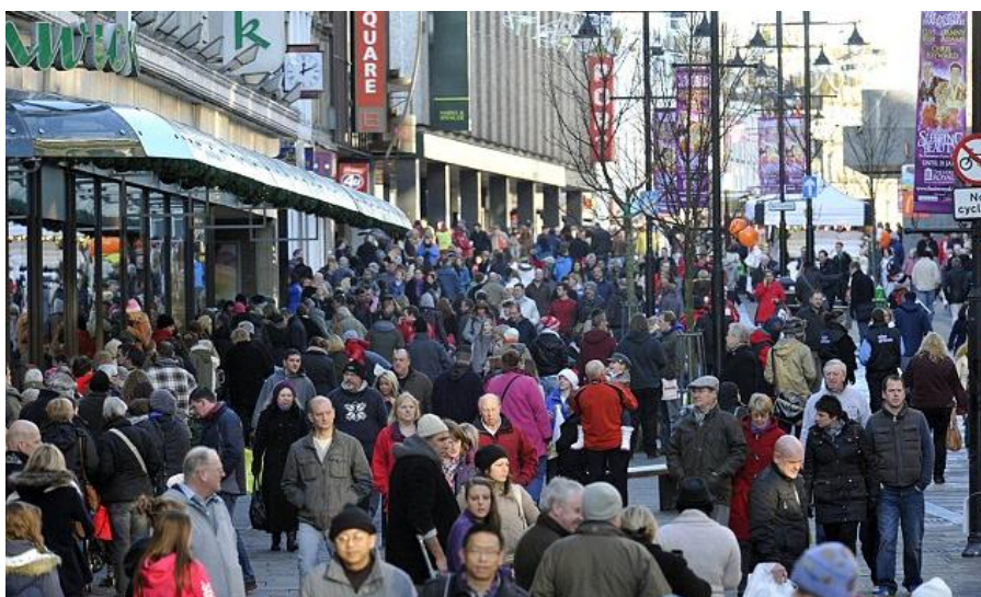
Figure 4 – an active centre