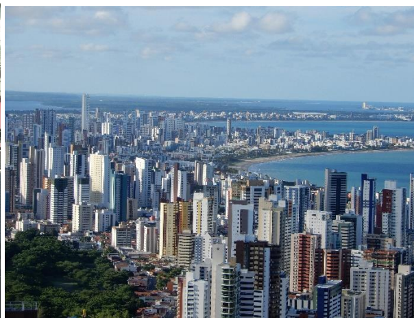
Figure 2 - development at the coast