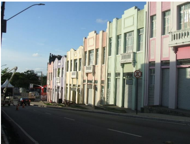
Figure 1 – the historic core