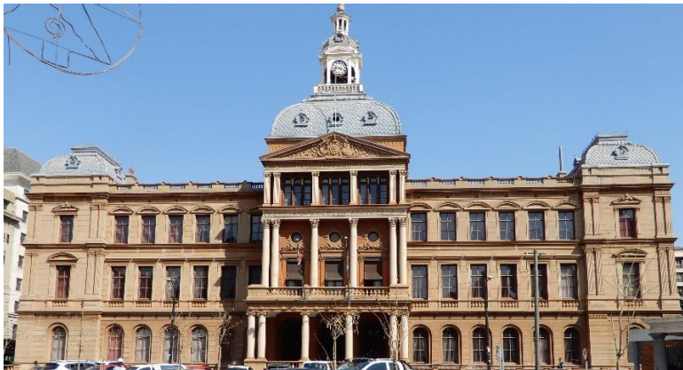
Figure 5 – the Afrikaan Parliament