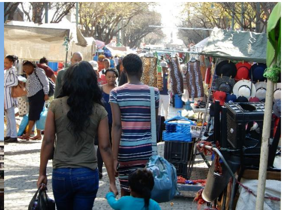
Figure 6 – Informal Street Market with Kruger statue in the distance