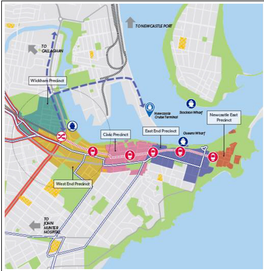
Figure 2. Polycentric linear 'precinct' approach to Newcastle city centre renewal (New South Wales Government, 2018).

similar to that of its namesake in the UK. It too has a vision of a city centre which is entrepreneurial and dynamic, is seen to be globally competitive, offers lifestyles able to attract new populations and has enhanced sustainability credentials through its 'new economy' as a smart city supported by carbon neutral initiatives. It too envisages key roles for the University as a civic partner and in the growth of the student population. It too has a focus on culture as a part of the economic base and a renewed focus on tourism, with densification through infill site residential development. Without any